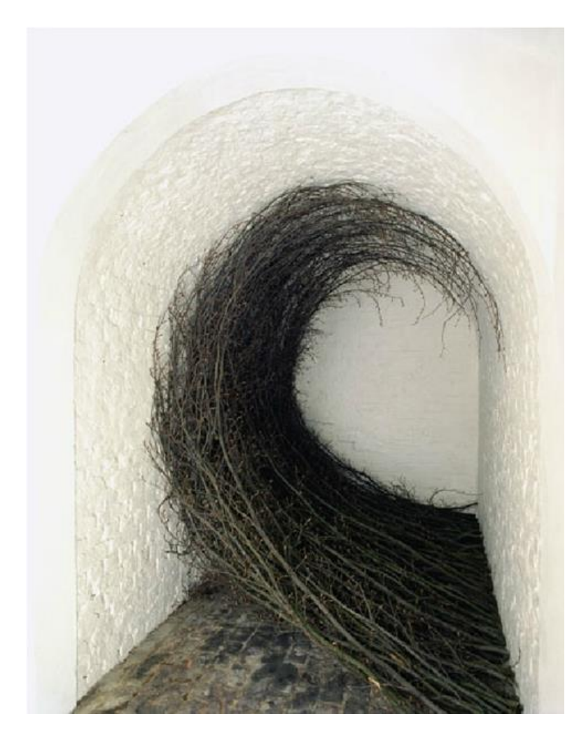
Figure 5 – Bob Verschueren, Installation I, 2002, beech branches. Galerie Usagexteme, Bruxelas (source: http://www. bobverschueren.net/ DimensionSupple mentaireEng.html)

Verschueren explored the sounds of the plants at the Banff Center for the Arts and presented extensively his photographs and installations in Europe, as well as in Japan and North America. The work of this artist invokes a phenomenological approach and, in each project, applies natural elements to create a relationship with the landscape and architecture of each location, whether in interior spaces, in natural outdoore or in the city.