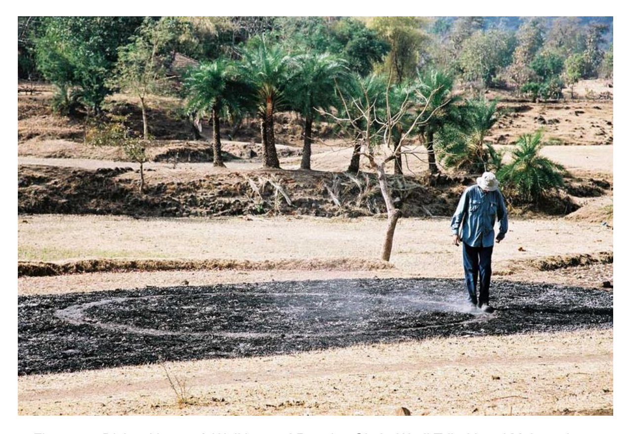
Figure 1 – Richard Long, A Walking and Running Circle, Warli Tribal Land Maharashtra, India, 2003

In relation to the potential of creative stimulation, and the valorization of imagination, Nature is constantly a reference in several areas, such as literature, music, architecture, and visual arts. If we reflect on visual arts for example, we can find artists who use materials directly from Nature and who recognize the value of organic materials and find creative stimulus in the natural world. Work in an external context is also frequent in a multiplicity of strategies, visual, phenomenological, contextual, among others. This is the case of the Land Art practices that emerged in the 1960s in the United States and Europe, in which artists use materials from Nature and work directly on the spot. In this context, we have the artist Richard Long (1945 - ) who uses natural materials and establishes a direct relationship between his body, and these materials. He works on issues related to scale, how it moves and interacts with places, and their elements (Figure 1). The selected spaces are areas with a wild look that doesn't pretend to appropriate them, but instead a personal brand of its course that goes away with time (LONG, 1994).