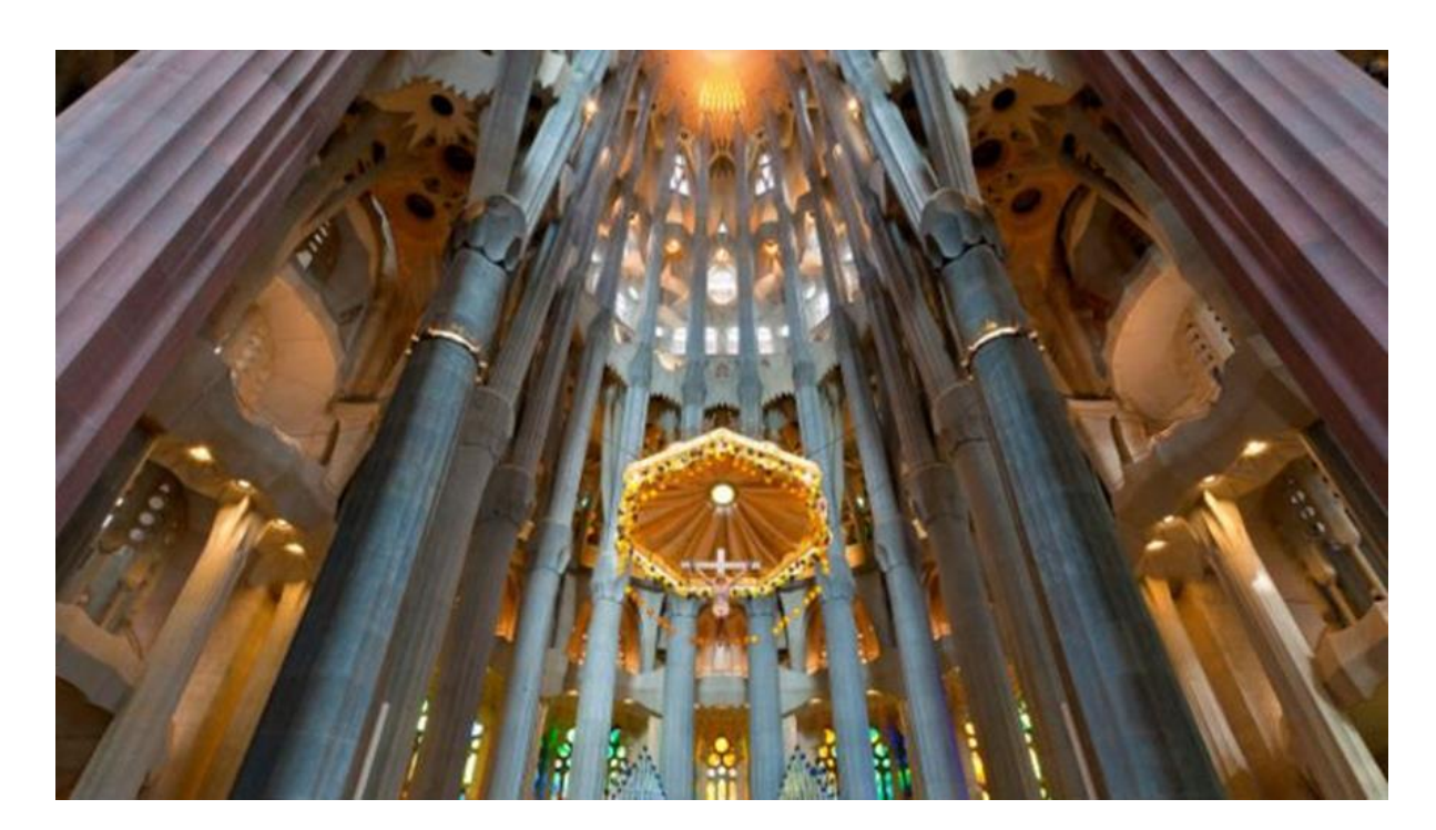
Figure 2 – Antoní Gaudí, detail of the Sagrada Familia Cathedral, Barcelona.

If we think about music, we have the "Grand Canyon Suite" by composer Ferde Grofée (1892 - 1972), in which the trip to the Arizona desert to watch the sunset over the Grand Canyon emerges as a base of creative inspiration. The way natural elements interact, the silence and sound of birds, drops falling, or wind in trees (SCHIAVONE, 2000). They are all possibilities of inspiration to create various melodies. As for architecture, we have the works of Antoní Gaudí (1852 - 1926) who, due to health problems since childhood, devoted his time to meticulously observating the forms and dynamics of nature, to the details of each branch, leaf, fruit or insect. From these experiences of Nature, he found inspiration and creativity for his works, such as: the "Casa Milá" (La Pedrera) built between 1905 and 1907; and the "Sagrada Familia" with the construction beginning in 1826 and scheduled completion date in 2026. The interior of this building is inspired by the forest, being constituted by columns that resemble trees and that branch in the ceiling (Figure 2). Gaudí found in contemplation of Nature the creative stimulus that helped him to design works with a unique and individual style (MODESTO, 2014).