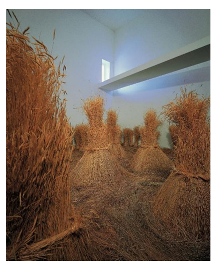
Figure 4 – Alberto Carneiro, a field after harvest for aesthetic delight of our body, 1976

My interest in the use of Nature as matter in the work has to do with the awareness or the search that the fundamental is the energy that comes out of things and circulates between them. [...] my own identification with what I had experienced, in a direct relationship with the materials and materials of the earth. Naturally, there is a lived relationship with Nature [...] (Alberto Carneiro cited in Amarante, 2015, p.23)