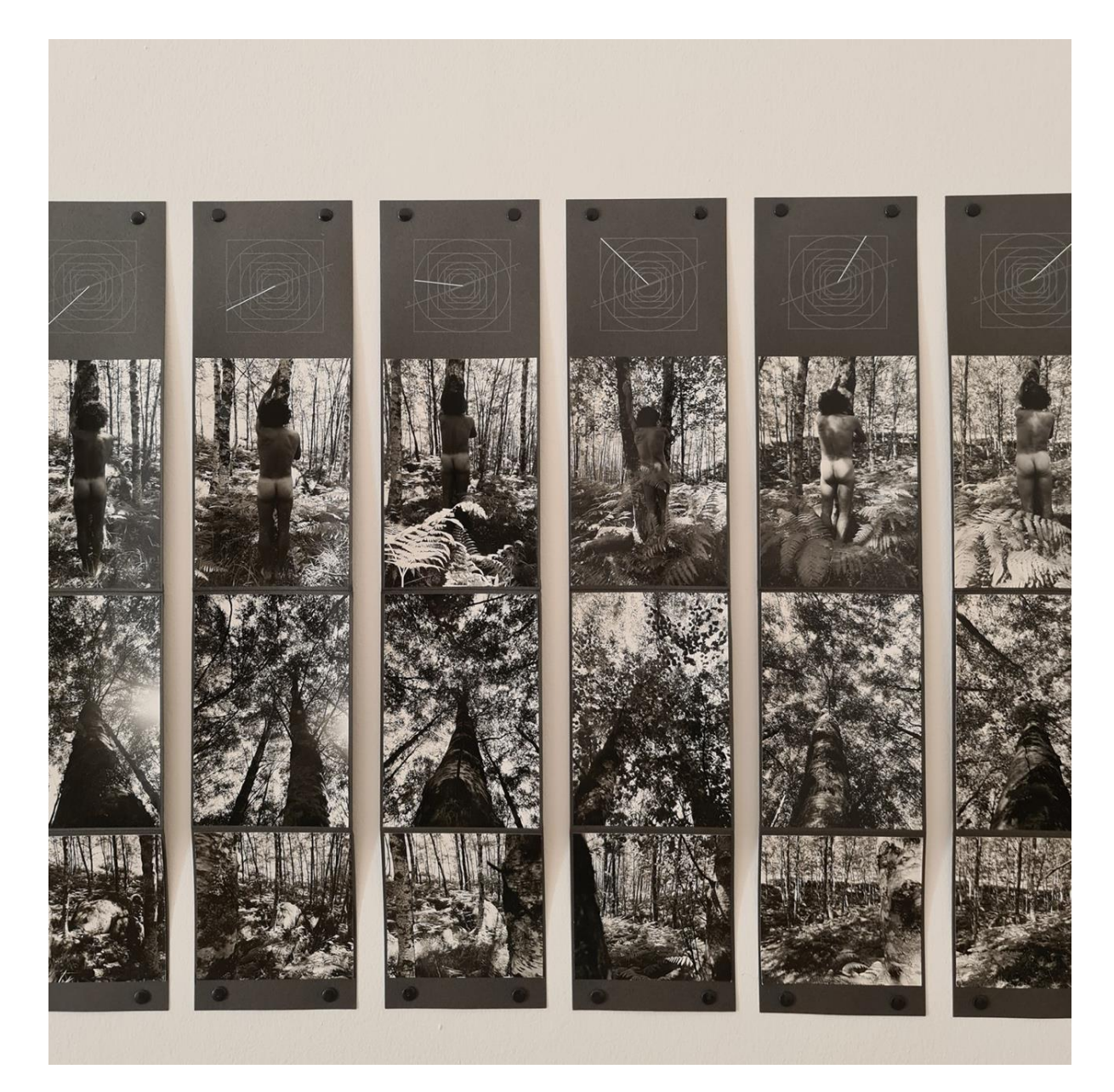
Figure 4. Alberto Carneiro, A Floresta (1978), detail, black and white photographs and drawing on paper (24 elements), Exhibition "Modus Operandi: Obras da Coleção de Serralves" (2021), Fundação de Serralves – Museu de Arte Contemporânea, Porto, Portugal.

In the first case, the artwork, being both everything and nothing, connects with the exterior from which it draws to construct itself. Therefore, it "deterritorializes" objects, practices, and meanings from their conventional or even natural use, incorporating them into its body and "reterritorializing" them within itself (as an artwork) and from itself (as an artwork + context). In the second case, the artwork "deterritorializes" itself, its practices, actions/objects, and meanings, inscribing them into another territory that is not its own (e.g.: it moves out of its conventional realm like museums or galleries) and intervenes, directly or indirectly, in natural spaces (e.g.: parks, woods, forests), compelling it to "reterritorialize" – to transform into a new