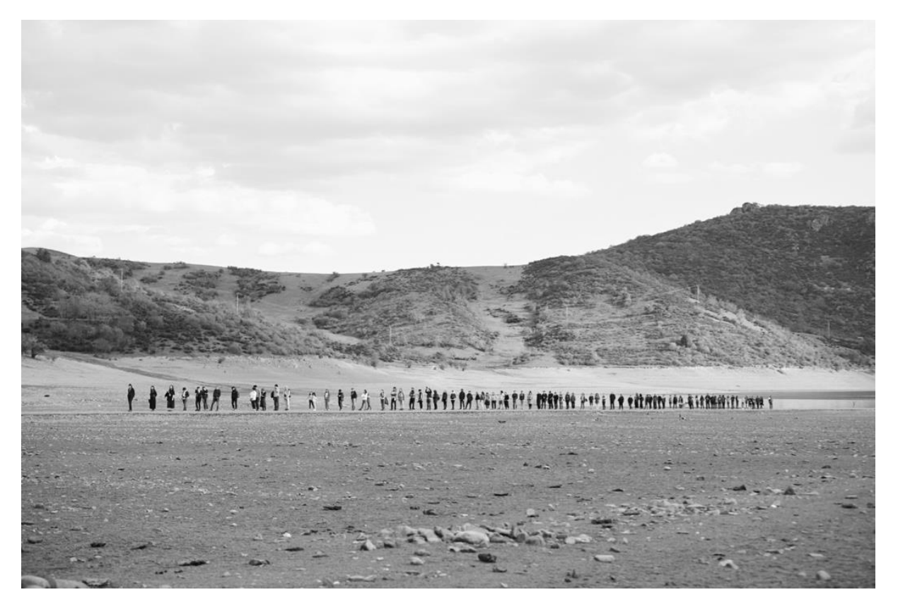
Figure 2. Hamish Fulton, Walking on and off the Path (2017), group walk near the Riaño Dam, 162 people, duration: 1 hour, Fundación Cerezales Antonino y Cinia, Cerezales del Condado, León, Spain.

In the context of Contemporary Art, the concept of "nature" has often been revisited and re-negotiated, distancing itself from the idea of an unchanging and deterministic origin, and assuming a closer affinity to something manipulable, provisional, and even virtual (Fortes, 2009, p. 542). This is because, as articulated by the Italian philosopher and art critic Gillo Dorfles in "Artificio e Natura" (2003 [1968]), even though the conflict between "nature" and "artifice" was already acute in the 20th century, the relationships between "human-nature" and "nature-object" are now immersed in a process of continuous transformation and "resignification", in an increasing trend that, according to the author, leads us to live increasingly surrounded by a world constructed of artificial objects: "It follows that, in the present day, we are led to live more and more surrounded by an artificial environment (...) even by artificial objects – following the many discoveries of electronic methodologies – within the realms of 'virtual nature', where even our sensorial experiences become artificialized (...) From all this stems (...) natural phenomena becoming increasingly completely artificial" (p. 17).