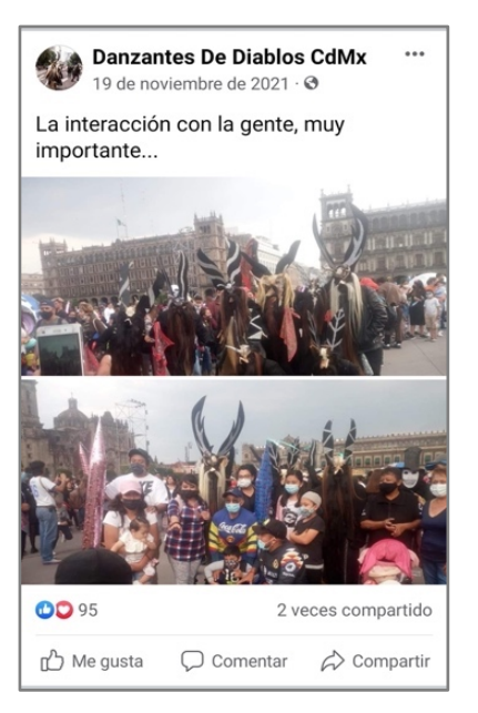
Illustration 5: Screenshot. Post on facebook page, 2021.

each other and with people who were interested in the dance (filmmakers, musicians, and researchers). Likewise, we met to share images and remember Costa Chica. Social media networks were also useful for showing support during difficult times by holding online raffles and dance classes. In this context, a diablos mask made by the Tenango was raffled off to support two of the group members who were sick with COVID-19. It was announced through a Facebook page we had opened a year earlier and that, up until this point, we had barely used. On the day of the drawing, the Tenango did his first live broadcast to show the raffle was done honestly, and he took advantage of the moment to speak briefly about the dance, the mask, and his town.