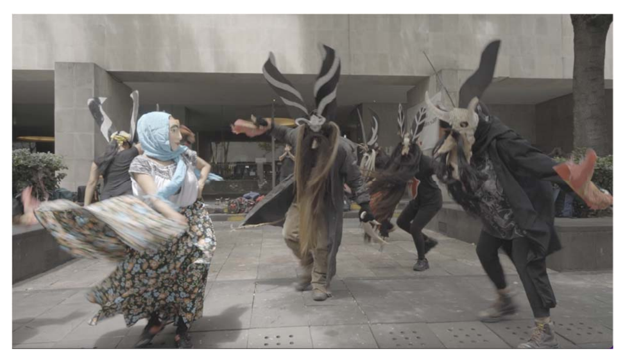
Illustration 7: Screenshot of video recording. Photographer: Venancio López, CDMX Center, 2021.

Bastide stated that the cultural reproduction of African cultures in the Americas occurred by transmitting the previous symbolic structures represented in their rituals, based not on stones and geographical points but on muscles and motor actions performed by the body. What is important, he said, is the organization, the symbolic structure, which is what guarantees the transmission of the traditions. For both Halbwachs and Bastide (1970: 94), all memories are simultaneously past and present, provided that previously lived experiences can only be remembered when they find a channel for expression in the present, that is, a new social framework of memory.