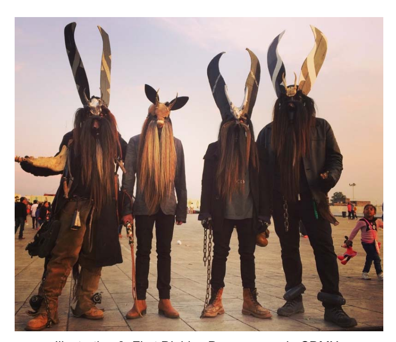
Illustration 3: First Diablos Dance group in CDMX.

Noticing this, and seeing that dance diversity was not part of the Day of the Dead celebration, the Tenango looked for a ritual context that was similar to what he knew: the festivities of the Day of the Virgin of Guadalupe at the Basilica of Our Lady of Guadalupe in