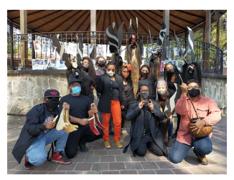
Illustration 6: Cultural Act for Women's Day.

problems that were set forth at the meetings, which let them reflect on and raise awareness about issues such as racism, social exclusion, and feminism, among others. In March 2021, a group of women belonging to the organization México Negro even held an Afro-feminist event in which some women from the association dressed and danced as diablas, using the group's masks; two of the male members had to take on a different role, as