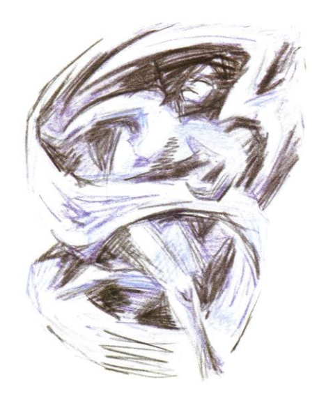
Figure 01. Dynamic space (Laban, 1984, cover).

I have been nominating this intensification – scene and performance's characteristic – of "spatial pulsing" (Fernandes, 2014), based on the two main categories created by Rudolf Laban - the "Eukinetics" (effort or dynamics) and the "Choreutics" (visual forms created by the movement in/ with space). The association of these two categories creates a dynamic space ("Dynamosphere"). Even in "stillness", we are in constant adaptation of multidirectional and integrated spatial dynamic forces. Nonetheless, we need to expand our possibility of spatial pulsing towards points and pathways unlikely used on the repetitive and limiting movements of everyday life. This expansion stimulates growth through a relationship between structure and creativity, form and dynamics, matter and energy.