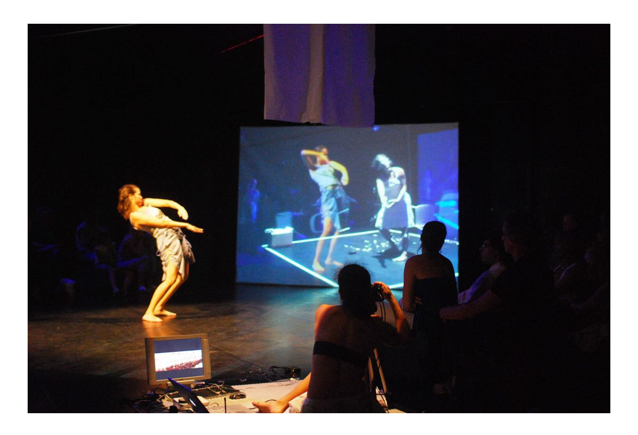
Figure 6 - Le Moi, le Cristal et L'Eau (2007). Telematic's principle used in the scenic emvironment in order to connect all acting spaces.

The public had access to the various events of each micro-context of the work, and through the imaging devices, we created connection points. The production of knowledge in the telematics dance started to create new demands for scenic productions and vice versa.