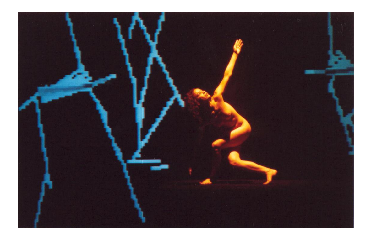
Figura 2 - Corpo Aberto (Open Body) (2001). Dancer performing with the software Life Forms created avatar images.

dialogue with attached devices. The aim was to show the presence of dance in other bodies and report that there was no interest in matching these bodies, quite the contrary.