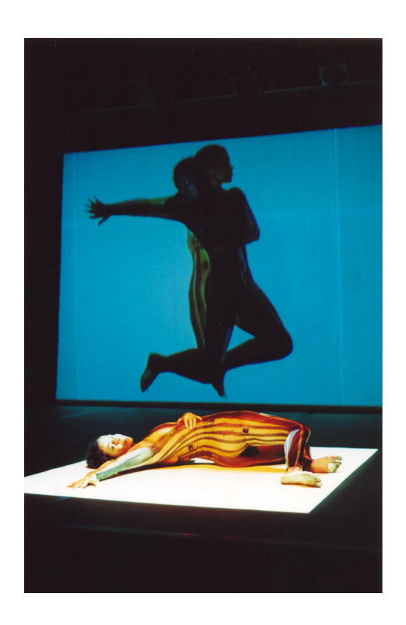
Figura 4 - Corpo Aberto (2001), first scene: dialogue between immobility and mobility, confrontation between horizontality and verticality.

The presentation of Corpo Aberto began with the confrontation between the motionless body of the photograph (a pre-set time) and the moving image of the body acting in real time, questioning the notion of temporality (see Figure 4). The space is distorted since the horizontal body was assessed in the verticality.