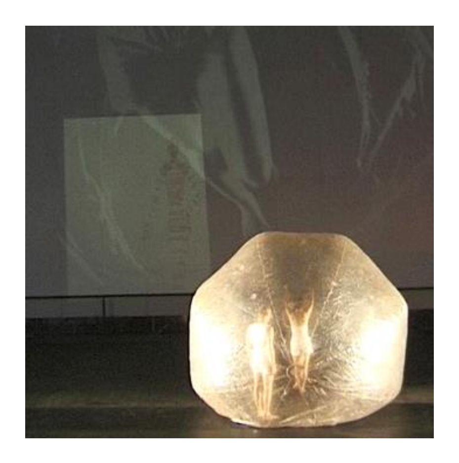
Figure 1 - entremeios (1998), by Ivani Santana. Projections with pre-recorded images, and images captured by a micro-camera installed in the interior of the sphere.

body to then be able to build on the body of the avatar. It is of the body as an information processor (Hansen, 2006) which makes the embodied<sup>8</sup> image.