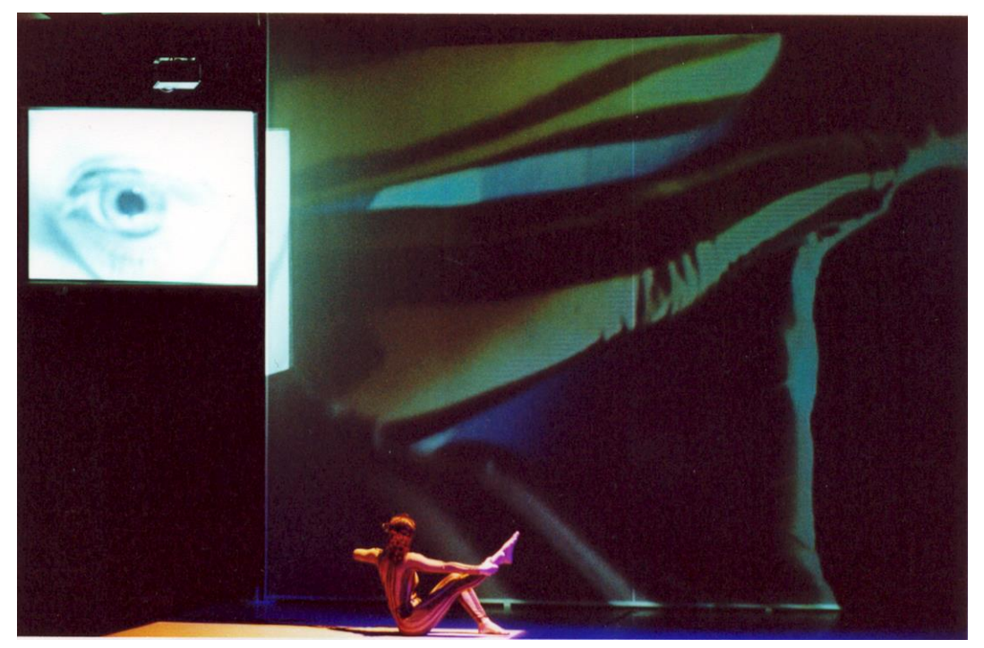
Figure 3 and 3.1 - Corpo Aberto (2001). Micro-cameras were used in the second stage to enable the range of vision in imperceptible points to the audience, such as the very action of my eyeball captured and projected during the entire scene and pictures of parts of my body or even the point of view from space. At one point in the scene, the image captured and projected onto the screen in the background is the very audience captured by the hand of the dancer.