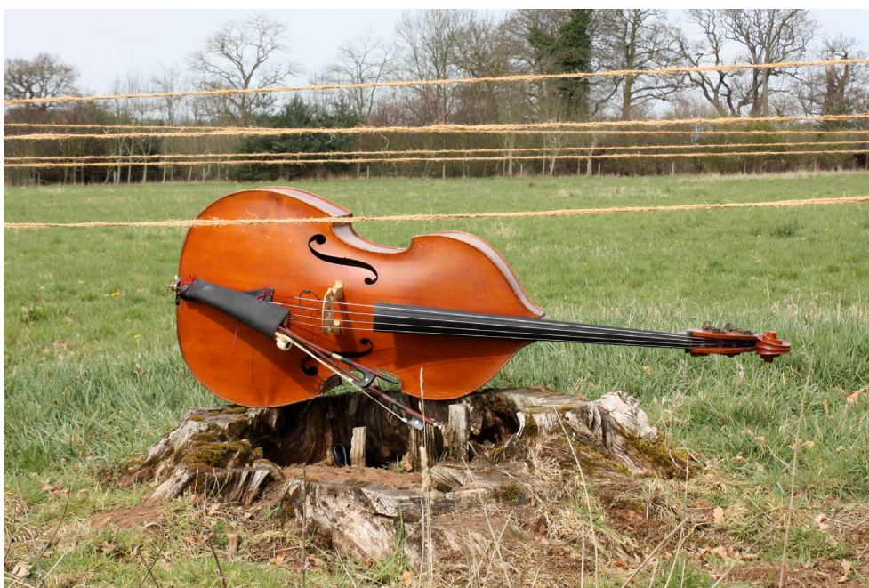
Fig 1: Double bass and strings on the field, Stoneleigh (UK), 14.04.2012