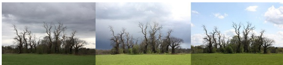
Fig. 2-4: Arrival photos 08.04., 11.04. and 08.05.2012, Stoneleigh (UK), Chestnut Site