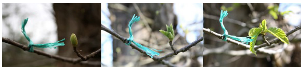
Fig. 5-7: 06.04., 15.04. and 30.04.2012, Stoneleigh (UK), Chestnut Site

I had also tied twelve small ribbons on various branches on the fourth day of working on the site to document the growth of the leaves during the phase that I worked there. At some point of each site visit I took a photograph of each of them, documenting the passing of time as it materialised in their growth.