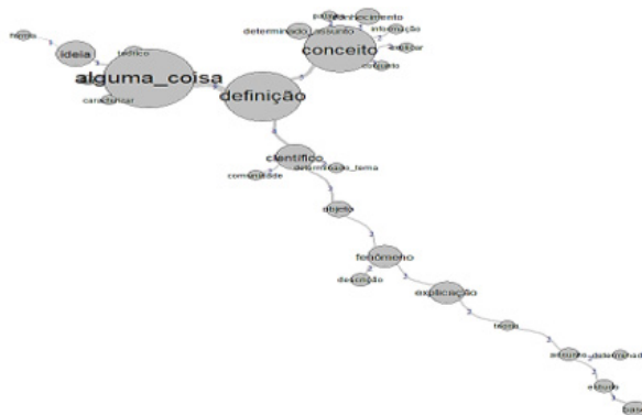
Figure 2: Similitude Tree for the responses to the question "What is a scientific concept?"

Next, to analyze the structure of representations in the undergraduates' responses, the Similitude Analysis was conducted. Through the construction of these graphical representations, it is possible to highlight not only the most frequent terms in a text but also the relations between the terms, indicating the most important connections made by the undergraduates, which to some extent express the structure of the representations of the object under study, according to Camargo and Justo (2013). In Figure 2, the Similitude Tree, constructed with the corpus originating from the set of responses to the aforementioned question, is presented.