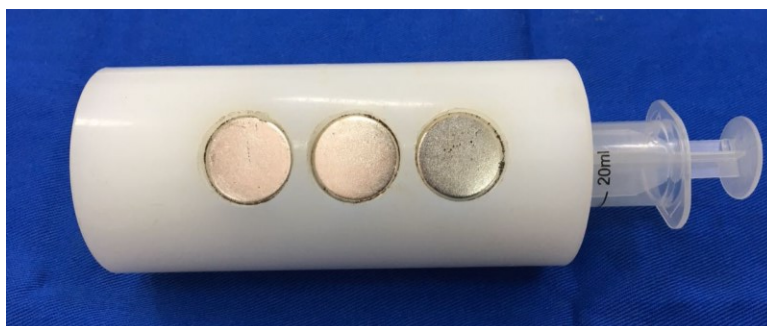
Figure 1 – Model constructed to produce the magnetic field (20 mT)

volume replacement was performed with with 3 ml Ringer (without magnetization). In order to yield the solution of Magnetized Ringer, the simple Ringer's solution was previously submitted to magnetic field of 20mT intensity produced by 6 magnets in an adapted model (Figure 1). The solution was exposed to MF for 2 hours immediately before the surgical procedure.