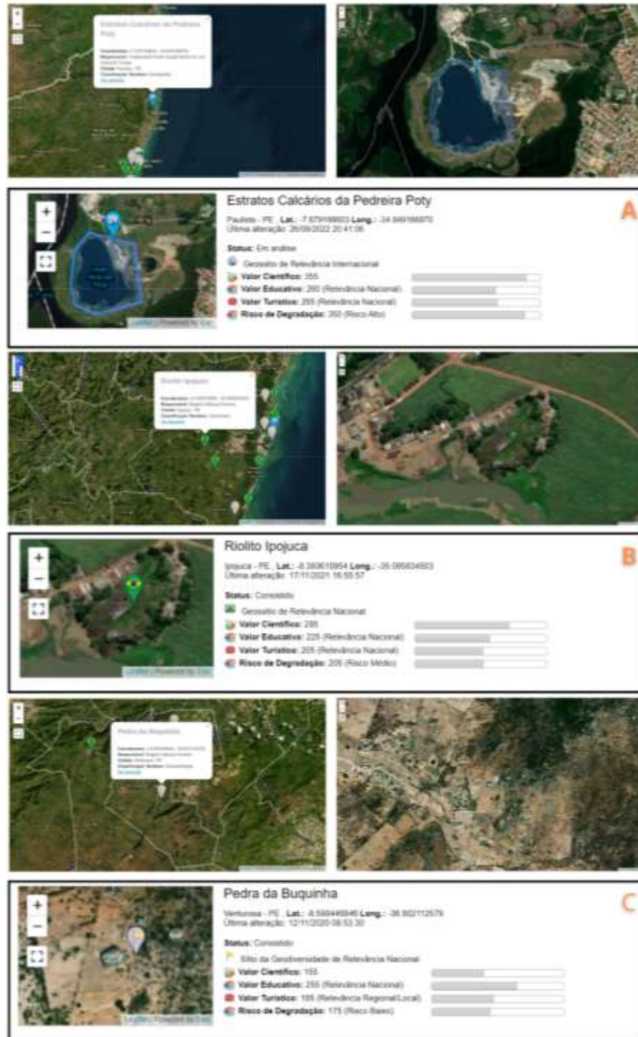
Figure 02 – Examples of geosites inventoried according to their relevance. A- Geosite of international relevance; B- Geosite of national relevance and C- Geosite of regional/local relevance.