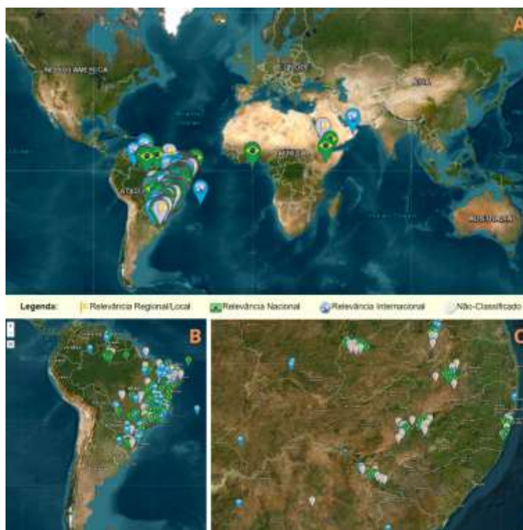
Figure 01 – Location of geosites inventoried and made available on the Geossit – CPRM website.

However, contemporary researchers use the nomenclature “geoheritage”, in an attempt to include all these elements of geodiversity, and to define new analytical biases for them added to classical methodologies and their adaptations. In other words, the use of the term “geoheritage” becomes much more inclusive, as it brings together all physical aspects without adding “preference” to a single title, taking into account the specificities of the area analyzed. Different from authors who use “Geological Heritage” and add a weight value to a single element. When analyzing a work that uses the expression above, it is clear that not just one element was used, but several. Hence, there is a need to use and promote geoheritage terminology in future publications within geosciences.